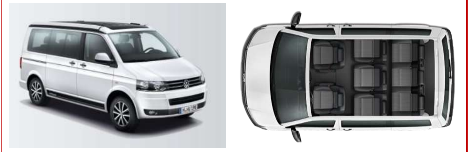
Suitable for 3 pax to 8pax // Leather Interior , Front & Rear Airconditiong //Heating// Tinted Windows//Baggage - Hand Baggage - 8 // Large Baggage - 10