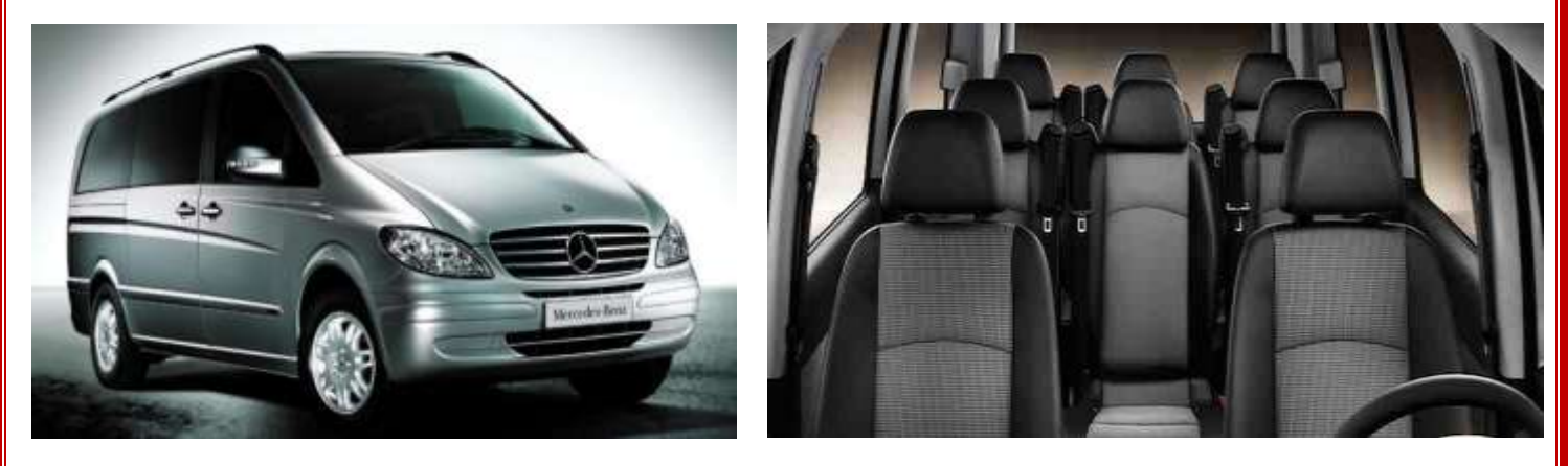
Suitable for 3 pax to 7pax // Leather Interior , Front & Rear Airconditiong //Heating// Tinted Windows//Baggage - Hand Baggage – 8 // Large Baggage – 10