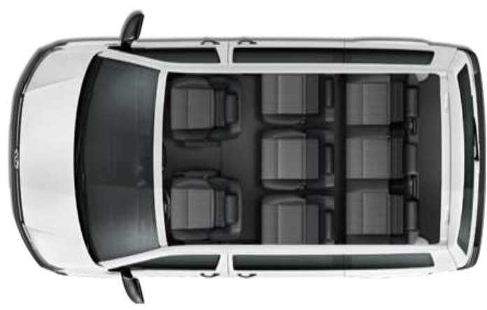
Suitable for 3 pax to 8pax // Leather Interior , Front & Rear Airconditiong //Heating// Tinted Windows//Baggage - Hand Baggage - 8 // Large Baggage - 10