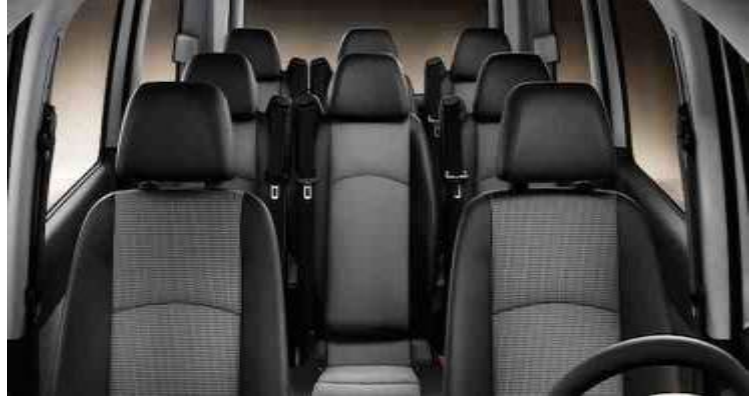
Suitable for 3 pax to 7pax // Leather Interior , Front & Rear Airconditiong //Heating// Tinted Windows//Baggage - Hand Baggage - 8 // Large Baggage - 10