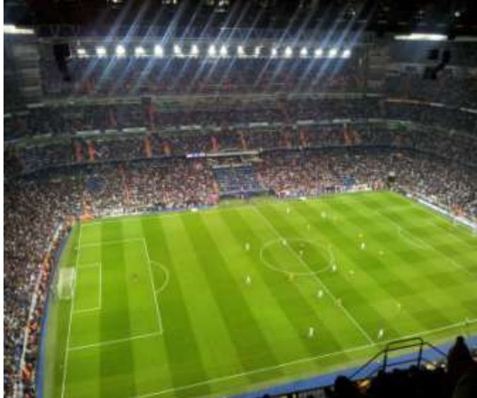
and Santiago Bernabeu Stadium. Afternoon is free at your leisure. Dinner at Restaurant. Overnight at Hotel.