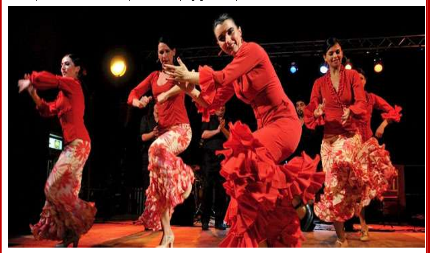
enjoy a Flamenco Show with Dinner (Admission & Dinner Included). Dinner at Restaurant. Overnight at Hotel.

Market (now the handicraft market) and the Old Synagogue. Later proceed to Seville. Check Into Hotel. In Seville we will