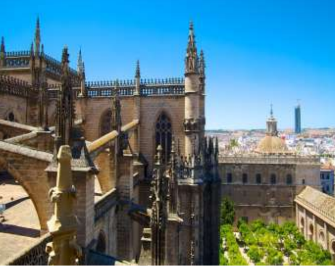
The tour will end with Santa Cruz Quarter, known for its orange trees and flower filled courtyards.