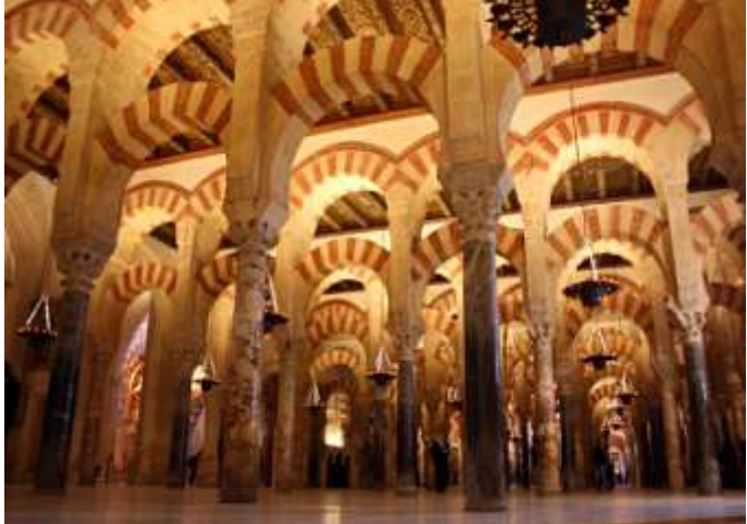
crowning symbol of the Caliphate and now a Cathedral. Continue with a walk through the Jewish quarter, the Old